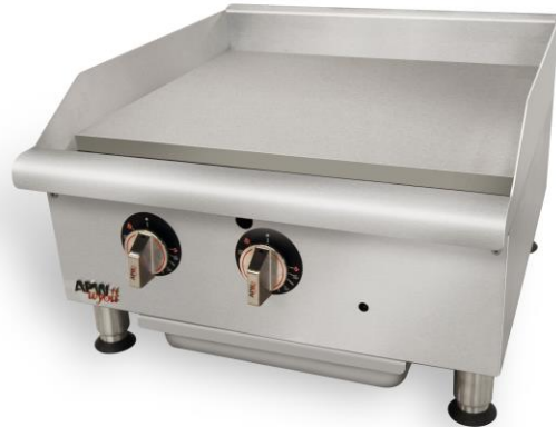
Model GGT-24i Gas Thermostatic Griddle