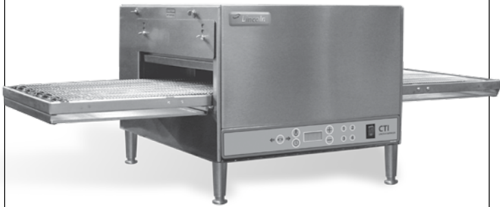
Shown with 50" (1270 mm) extended conveyor.